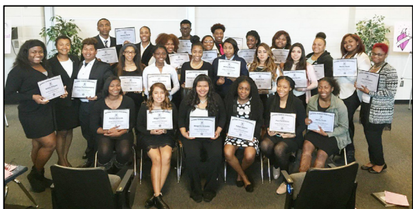
Mundy's Mill High School – 2016 National Honor Society Induction Ceremony